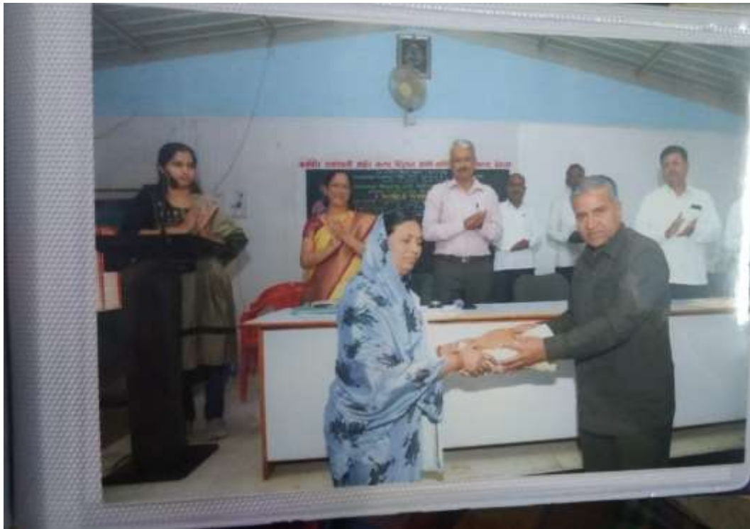
Principal Aher Sir felicitating the women on the occasion of Women's Day